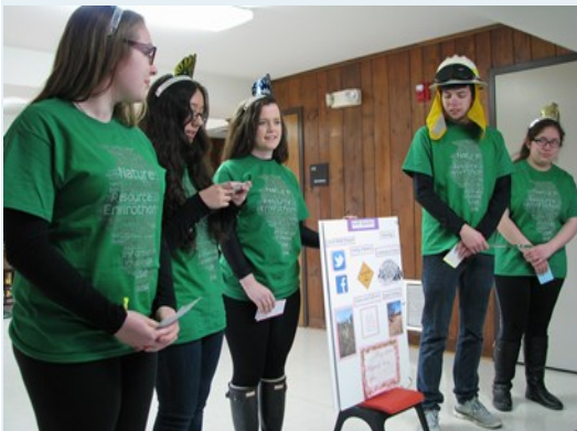
Belvidere High School Oral Presentation

The Envirothon experience provides students with the ability to think critically and enhance their problem solving skills. It gives students the opportunity to be role models in their community. Lastly, it prepares student for future careers in natural resource areas.